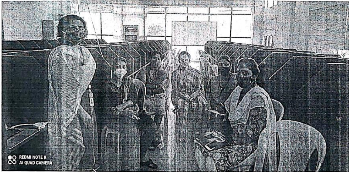
Faculty Members of BCA Dept.