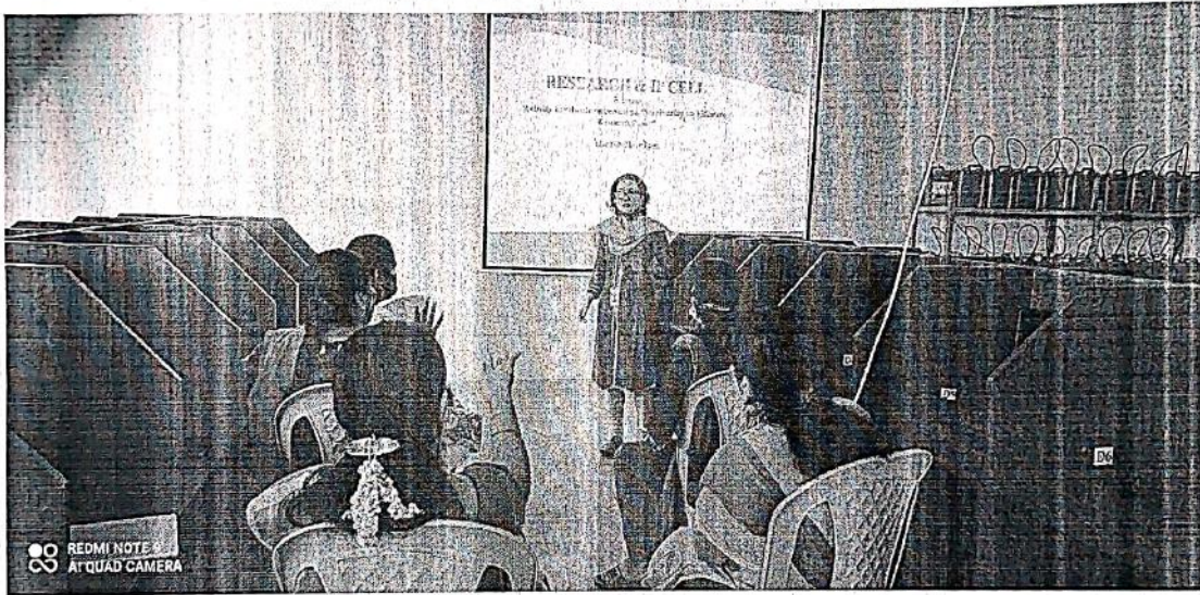
Discussion Exchange Views